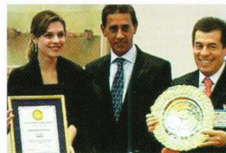
Banco Bradesco SA, Brazil receiving Golden Peacock Award in Lisbon (Portugal)

All entries / applications are treated in strict confidence, and the entire evaluation process is confidential .