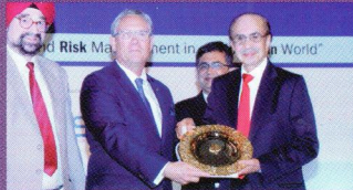
Mr. Adi Godrej Chairman, Godrej Group receiving Golden Peacock Lifetime Achievement Award for Ethical Leadership