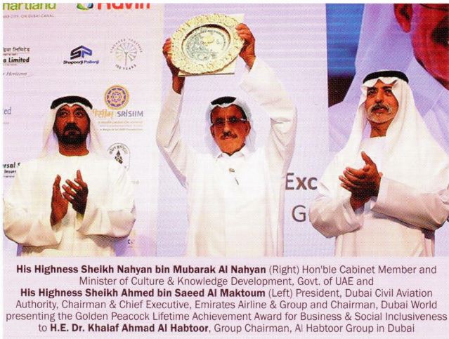
His Highness Sheikh Nahyan bin Mubarak Al Nahyan (Right) Hon'ble Cabinet Member and Minister of Culture & Knowledge Development, Govt. of UAE and His Highness Sheikh Ahmed bin Saeed Al Maktoum (Left) President, Dubai Civil Aviation Authority, Chairman & Chief Executive, Emirates Airline & Group and Chairman, Dubai World presenting the Golden Peacock Lifetime Achievement Award for Business & Social Inclusiveness to H.E. Dr. Khalaf Ahmad Al Habtoor , Group Chairman, Al Habtoor Group in Dubai