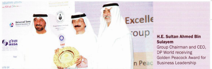
H.E. Sultan Ahmed Bin Sulayem Group Chairman and CEO, DP World receiving Golden Peacock Award for Business Leadership