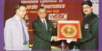
Mr. Kumar Mangalam Birla Chairman, Aditya Birla Group receiving Golden Peacock Business Leadership Award