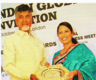
Mr. N. Chandrababu Naidu Hon'ble Chief Minister, Govt. of Andhra Pradesh State, India receiving Golden Peacock Award for Leadership in Public Service & Economic Transformation from The Rt. Hon. Priti Patel MP, (the then) Cabinet Minister & the Secretary of State for International Development, Government of UK

Award winners are eligible to use the Golden Peacock Awards Logo with year on all printed and promotional materials, which evidences the highest accolade received by the organisation.