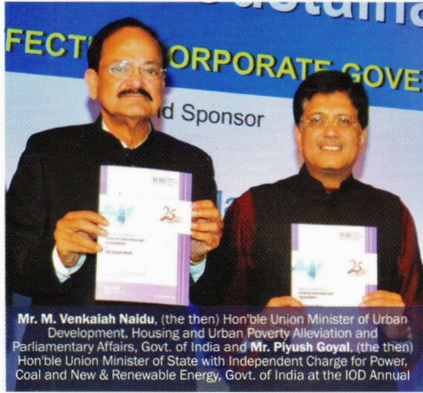
Mr. M. Venkaiah Naidu, (the then) Hon'ble Union Minister of Urban Development, Housing and Urban Poverty Alleviation and Parliamentary Affairs, Govt. of India and Mr. Piyush Goyal, (the then) Hon'ble Union Minister of State with Independent Charge for Power, Coal and New & Renewable Energy, Govt. of India at the IOD Annual