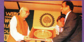
Mr. Sunil Bharti Mittal Chairman, Bharti Enterprises receiving Golden Peacock Business Leadership Award