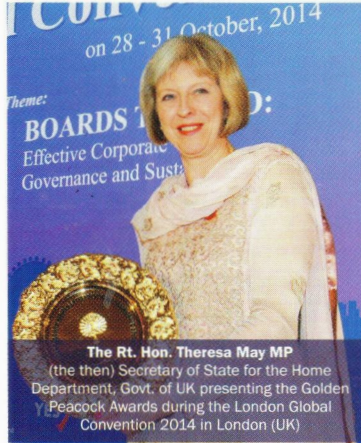
The Rt. Hon. Theresa May MP (the then) Secretary of State for the Home Department, Govt. of UK presenting the Golden Peacock Awards during the London Global Convention 2014 in London (UK)