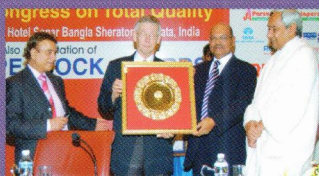
Mr. Anil Agarwal Founder Chairman, Vedanta Group receiving the Golden Peacock Business Leadership Award. Also Seen (on Right), Mr. Naveen Patnaik, Hon'ble Chief Minister, Govt. of Odisha State