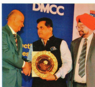
Mr. Amitabh Kant, IAS Chief Executive Officer, NITI Aayog, Govt. of India receiving Golden Peacock Award for Leadership in Economic Transformation