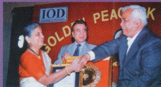
Mrs. Sudha Murthy Chairperson, Infosys Foundation receiving Golden Peacock Women Leadership Award