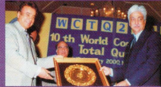
Dr. Azim H. Premji Chairman, Wipro Group receiving Golden Peacock Business Leadership Award