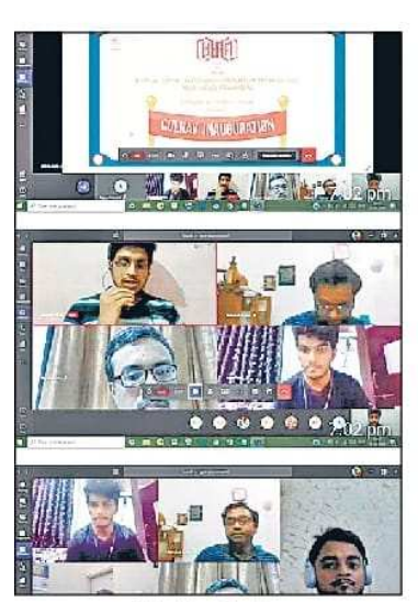
एमएनएनआईटी में वार्षिकोत्सव 'कलरव 2020' का ऑनलाइन आगाज हुआ।